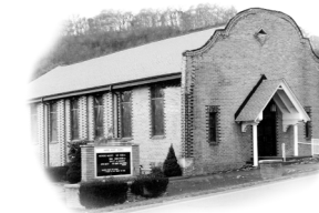
Sacred Heart Church 54038 St Mary Ave Neffs, OH 43940