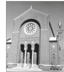
St John Church 415-37th St Bellaire, OH 43906