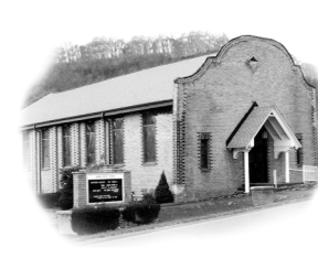
Sacred Heart Church 54038 St Mary Ave