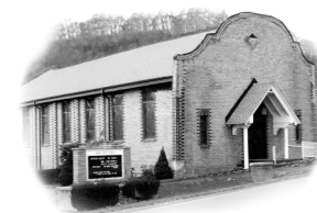
Sacred Heart Church 54038 St Mary Ave