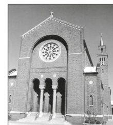
St John Church 415-37th St