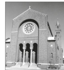
St John Church 415-37th St