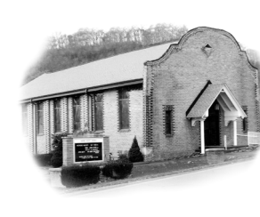
Sacred Heart Church 54038 St Mary Ave